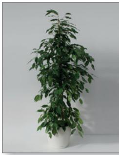
Weeping fig ( Ficus benjamina )* Item no. 62-200