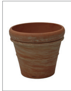
Terracotta cachepot (for hire) Item no. 62-228