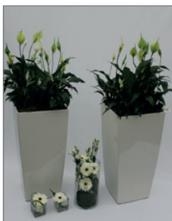
Plants – set C Item no. 62-216

comprising: 2 x Lechuza vases, white, 75 cm, green planted, 2 x small table vases (glass) with white-green coloured cut flowers, 1 x small vase with seasonal cut flowers, total height: appr. 40 cm