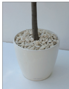
Pebble cover for visible pots Item no. 62-219