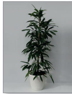
Weeping fig ( Ficus binnendijkii alii )* Item no. 62-201