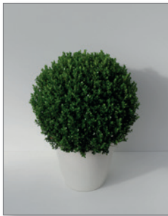
Boxwood, spherical (Buxus sempervirens)* Item no. 62-209

80 cm to 100 cm (01) EUR 44.00 diameter of globe: 40 to 50 cm