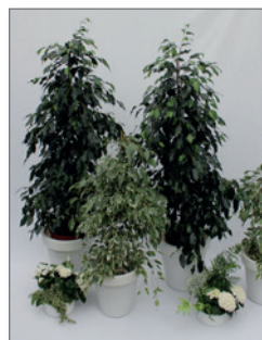
Plants – set B Item no. 62-215

comprising: 2 x Ficus benjamina, appr. 160-180 cm 1 x table bowl, appr. ø 15 cm 1 x bowl, appr. ø 20 cm 2 x green plants, appr. 80 cm