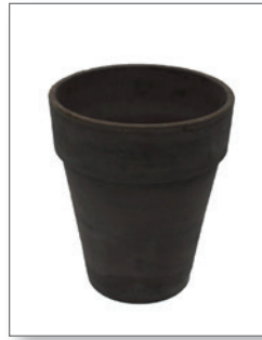
Ceramic cachepot (for hire) Height approx. 50 cm Item no. 62-226