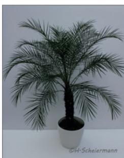
Date palm ( Phoenix roebelenii )* Item no. 62-207