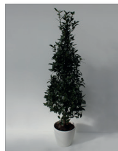
Bay laurel, pyramidal ( Laurus nobilis )* Item no. 62-206