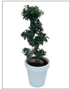
Bonsai tree (Ficus microcarpa ginseng) Item no. 62-222