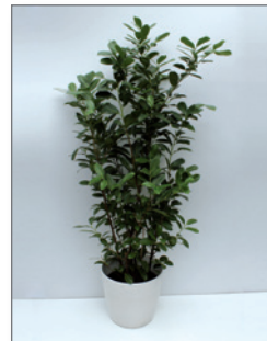
Cherry laurel ( Prunus laurocerasus )* Item no. 62-213