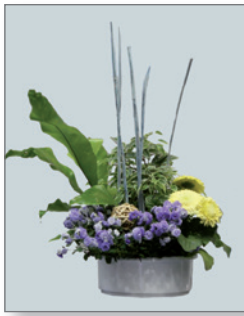
Bowl with plants (for sale) Item no. 62-230 to Item no. 62-232