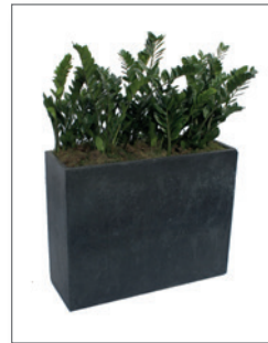
Planted stone plantbox (for hire) (stone vessel, anthracite) Item no. 62-225

Picture: planted with Spathiphyllum (01) Size: W: 95 cm / D: 40 cm / H: 95 cm