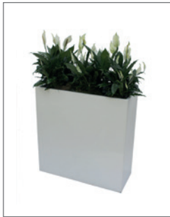
Planted room divider (for hire) (high gloss white) Item no. 62-224

with Spathiphyllum (01) with Zamioculcas (02)