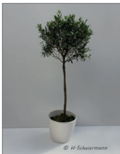
Olive tree, spherical ( Olea europaea )* Item no. 62-204