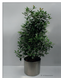
Photinia, bush ( Photinia fraseri )* Item no. 62-211