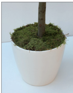
Moss cover for visible pots Item no. 62-218