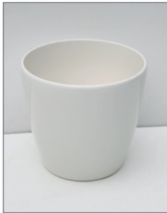
High Gloss (for hire) Item no. 62-227