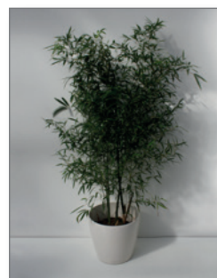
Bamboo ( Phyllostachys bissetii )* Item no. 62-208