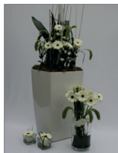
Plants – set D Item no. 62-217

comprising: 2 x Lechuza vases, white, 75 cm, green planted, 2 x small table vases (glass) with white-green coloured cut flowers, 1 x small vase with seasonal cut flowers, total height: appr. 40 cm