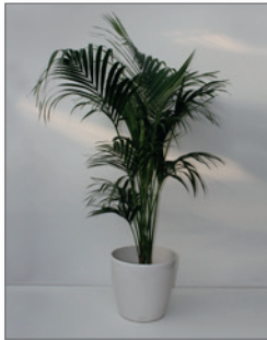
Kentia palm ( Howeia fosteriana )* Item no. 62-202