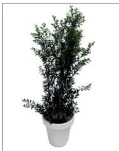
Ilex – bush (Ilex crenata) Item no. 62-223