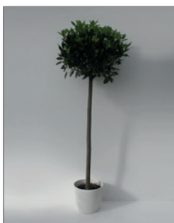
Bay laurel, spherical ( Laurus nobilis )* Item no. 62-205