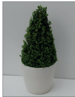
Boxwood, pyramidal (Buxus sempervirens)* Item no. 62-210

130 cm to 150 cm (02) EUR 105.00 diameter of globe: 80 to 100 cm