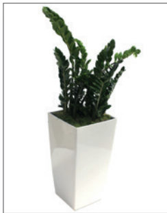
Lechuza vase (for hire) planted with zamioculcas, appr. 120 cm high Item no. 62-240

Picture: planted with Zamioculcas (02) Size: W: 100 cm / D: 40 cm / H: 80 cm