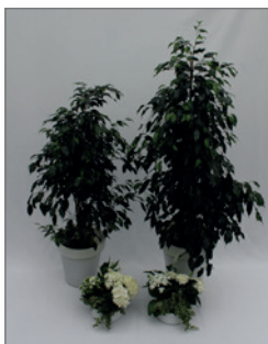
Plants – set A Item no. 62-214

comprising: 1 x Ficus benjamina, appr. 160-180 cm 1 x Ficus benjamina, appr. 100-120 cm 2 x table bowls, appr. ø 15 cm, green / white planted