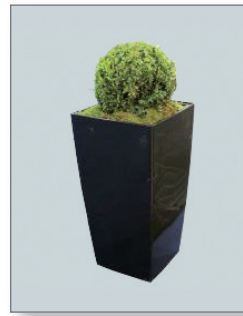
Lechuza vase (for hire) planted with boxwood (spherical) Item no. 62-236 to Item no. 62-238