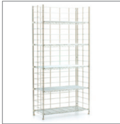
Shelving unit SHOPLINE EUR 76.00