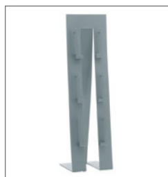
Brochure rack KIOS EUR 46.60 Item no. 01-270