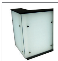
Counter LUNA angle-type element EUR 262.40 Item no. 01-102

Size: W: 99 cm + 49,5 cm / D: 77 cm / H: 113,5 cm backlit, 1 shelf