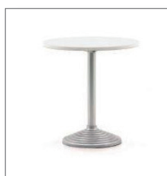
Table FERRUM 74 EUR 64.10 Item no. 01-008 High table FERRUM 110 EUR 64.10 Item no. 01-009 top: white (01) top: black (02) Size: ø 70 cm / H: 74 cm + 110 cm Base: cast iron

Table FERRUM 74 EUR 78.10 Item no. 01-351 High table FERRUM 110 EUR 78.10 Item no. 01-353 top: frosted glass (28) Size: ø 70 cm / H: 74 cm + 110 cm Frame: cast iron