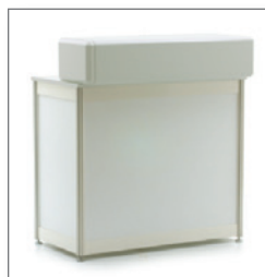
Counter OCTA with top EUR 194.30 Item no. 01-312 Counter OCTA without top EUR 171.10 Item no. 01-313

Size: W: 99 cm / D: 85 cm / H: 115 and 90 cm lockable, 1 shelf