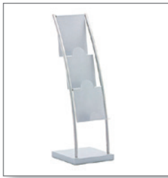
Brochure rack PARTNER EUR 33.80