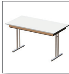
Table FAGUS EUR 98.40 Item no. 01-216 top: white (01) Size: W: 130 cm / D: 70 cm / H: 73 cm folding Frame: chrome-plated

Table QUADRAT EUR 56.20 Item no. 01-217 top: white (01) Size: W: 70 cm / D: 70 cm / H: 73 cm Frame: chrome-plated