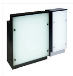
Counter LUNA 1,0R EUR 262.40 Item no. 01-100 Counter LUNA 0,5R EUR 219.60 Item no. 01-101

Size: W: 100 cm / D: 70 cm / H: 110 and 90 cm sliding doors, lockable, 2 shelves