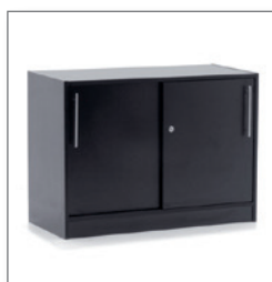
Sideboard BOSTON EUR 91.00 Item no. 01-297

Size: W: 90 cm / D: 45 cm / H: 75 cm Revolving doors, lockable, 1 shelf