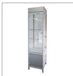
Display cabinet ELEXANA EUR 203.10 Item no. 01-298