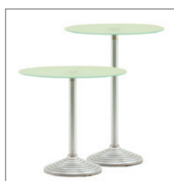
Table FERRUM 74 EUR 78.10 Item no. 01-351 High table FERRUM 110 EUR 78.10 Item no. 01-353 top: frosted glass (28) Size: ø 70 cm / H: 74 cm + 110 cm Frame: cast iron

Side table KUBUS EUR 64.10 Item no. 01-105 white (01) Size: W: 40cm / D: 40cm / H: 45 cm