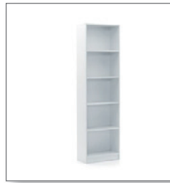
Shelf unit ABACUS EUR 59.00