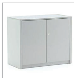
Sideboard ATLANTA EUR 96.00 Item no. 01-296

Size: W: 98 cm / D: 48 cm / H: 90 cm Sliding doors on display and storage sections, lockable