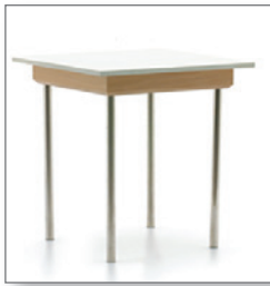
Table QUADRAT EUR 56.20 Item no. 01-217 top: white (01) Size: W: 70 cm / D: 70 cm / H: 73 cm Frame: chrome-plated