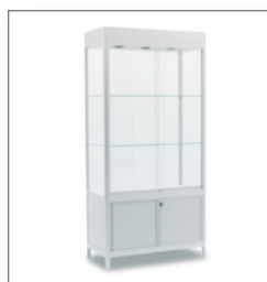
Display cabinet ELEXANA EUR 235.20 Item no. 01-214

Size: W: 48 cm / D: 48 cm / H: 203 cm Revolving doors, lockable, with lighting