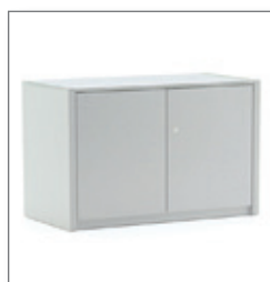
Sideboard Kiel EUR 91.70 Item no. 01-127

Size: W: 90 cm / D: 45 cm / H: 74 cm Sliding doors, lockable, 1 shelf