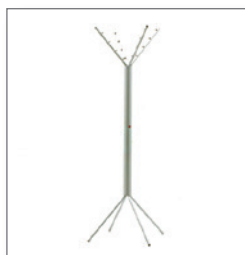
Coat rack ALUCLAC EUR 40.20 Item no. 01-291

Size: W: 77 cm / D: 77 cm / H: 113,5 cm backlit, 1 shelf