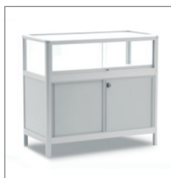
Display counter ELEXA EUR 128.00 Item no. 01-213

Size: W: 98 cm / D: 48 cm / H: 203 cm Sliding doors, lockable, with lighting