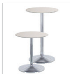
Table 70 Item no. 61-277 EUR 102.00 High table 110 Item no. 61-279 EUR 108.00 Top: satin-frosted glass (28) Size: H: 70 cm + 110 cm ø Top: 70 cm Base: metal, colour: stainless steel

Table 70 Item no. 61-276 EUR 54.50 High table 110 Item no. 61-278 EUR 61.00 Top: white (01) Top: black (02) Top: beech decor (16) Size: H: 70 cm + 110 cm ø Top: 70 cm Base: metal, colour: stainless steel