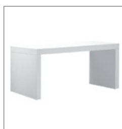
Table for meetings LEVANTE 75 EUR 154.00 Item no. 61-232 white (01) Size: W: 120 cm / D: 60 cm / H: 75 cm

High table WEINFASS EUR 59.00 Item no. 61-148 oak (19) Size: H: 95 cm, ø 58 cm