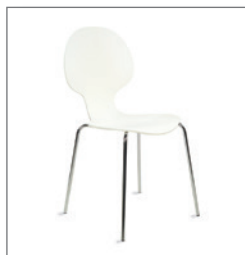
Chair BUNNY EUR 33.50 Item no. 61-101 white (01) Size: W: 52 cm / D: 53 cm / H: 85 cm Seat height: 47 cm Seat/Backrest: varnished wood