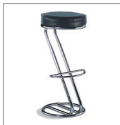
Bar stool PATTI EUR 29.00 Item no. 61-103 white (01) black (02) Size: ø: 35 cm / H: 82 cm Seat height: 82 cm Seat/Backrest: artificial leather