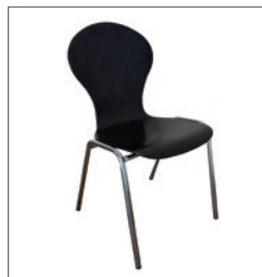
Chair ADAM EUR 33.50 Item no. 61-282 black (02) Size: W: 46 cm / D: 47 cm / H: 86 cm Seat height: 46 cm Seat shell: varnished wood