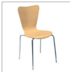
Chair EVA EUR 33.50 Item no. 61-098 beech untreated (13) Size: W: 47 cm / D: 57 cm / H: 84 cm Seat height: 47 cm Seat/Backrest: varnished wood