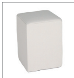
Stool HOLLY EUR 20.00 Item no. 61-233 white (01) Size: W: 40 cm / D: 40 cm / H: 47 cm Seat height: 47 cm