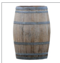
High table WEINFASS EUR 59.00 Item no. 61-148 oak (19) Size: H: 95 cm, ø 58 cm