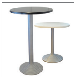
Table 70 Item no. 61-276 EUR 53.00 High table 110 Item no. 61-278 EUR 59.00 Top: white (01) Top: black (02) Top: beech decor (16) Size: H: 70 cm + 110 cm ø Top: 70 cm Base: metal, colour: stainless steel