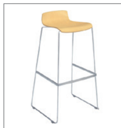
Bar stool YPSILON EUR 39.50 Item no. 61-180 white (01) beech untreated (16) Size: W: 51 cm / D: 39 cm / H: 90 cm Seat height: 80 cm Seat shell: varnished and laminated wood