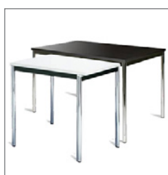
Table MEDOLA 80 EUR 44.00 Item no. 61-140 white (01) black (02) Table MEDOLA 120 EUR 52.00 Item no. 61-141 white (01) black (02) Size: W: 80 + 120 cm / D: 80 cm / H: 75 cm Frame: chrome-plated

Table for meetings LEVANTE 75 EUR 154.00 Item no. 61-232 white (01) Size: W: 120 cm / D: 60 cm / H: 75 cm